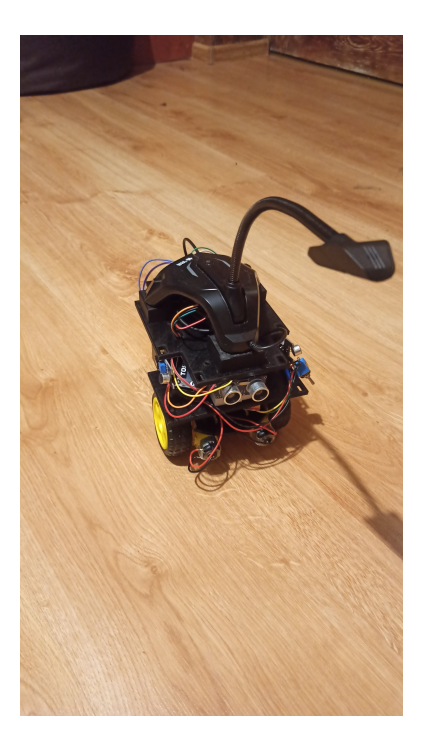
Figure 2: Robot